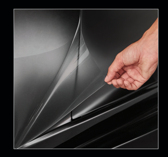
Scotchgard<sup>™</sup> Paint Protection Film Pro Series is a clear, 8 mil protective film.

There's a 100% chance something will wreck the paint on your new car. Rocks, bugs, sand, keys, salt, rings — you name it. Our clear, 8 mil thick film tirelessly protects your paint, even when you can't. Get it professionally applied to the high-impact, vulnerable areas of your vehicle.